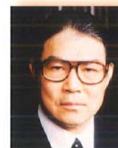
霍震霆太平紳士 The Hon. Timothy T T FOK, GBS, JP