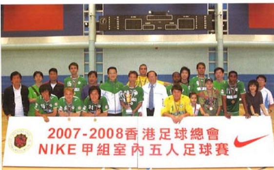
2007-2008香港足球總會 NIKE 甲組室內五人足球賽

The competition is organized by HKFA and sponsored by Nike HK Limited. The tournament aims to develop the 5-a-side into a wide sports in Hong Kong and raise the standard and participation of the local football. 6 teams from the First Division League participated in the competition and Happy Valley was crowned champion in this tournament.